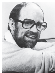
Brian Macdonald , C.C., Dancer (1928–2014)